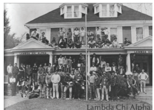
Lambda Chi Alpha class of 1976 (photo from Gettysburg College yearbook)

Are you a member of the class of 1976? Share your favorite Lambda Chi stories by submitting an update on our website ( lambdachigettsburg.com ).