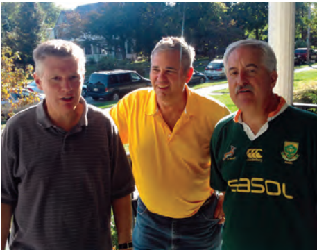
Alumni brothers at Homecoming Weekend.

The school year started off with moving into our newly renovated house. Over the summer, our house received many renovations, including a fresh coat of paint, sprinklers, new floors in some areas, and a renovated third floor. What was once a spot for storage became four new bedrooms and home to seven of our brothers. New railings and walkways made the outside look as nice as the inside now does.