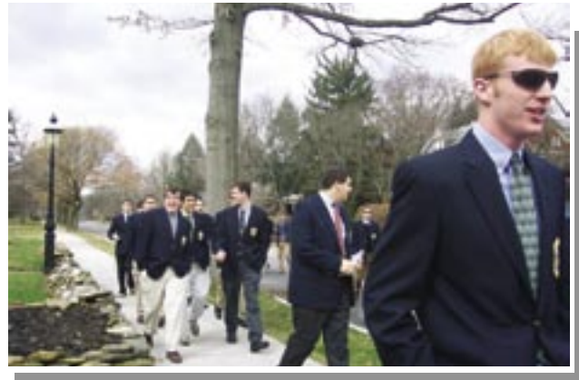
Members proudly wear their Bid Day jackets as they go to extend bids. The Alumni Executive Board subsidized the cost of the jackets for the chapter. Thank you donors!

We thank everyone for their continued support and extend an open invitation for any and all alumni to stop by any time and say hello. If you'd like to get your hands dirty, come by July 21-23 (see page 1) and give us a hand on our work weekend!