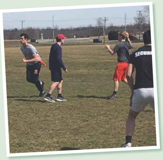
Lambda Chi had a big philanthropy week in March! The Pie-A-Lambda-Chi table at Relay for Life was super successful! Finished it up with a flag football tourney to benefit the local charity SCCAP. Pictured is the LXA team in action.