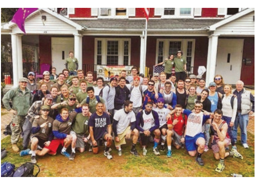
2017 Ruck March (co-sponsored with SAE)

We also contribute to the college's life safety events, demonstrating safety procedures to students who live on campus (including fire extinguisher safety, kitchen safety, etc.). Every current Lambda Chi is involved in another organization on campus in addition to the fraternity--such as sports teams and other non-Greek clubs and organizations. This helps us to expand Lambda Chi's presence at the college and to maintain our reputation as being a diverse group of men with a wide variety of interests and background.