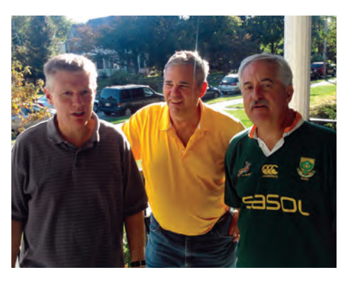
Alumni brothers at Homecoming Weekend.

The school year started off with moving into our newly renovated house. Over the summer, our house received many renovations, including a fresh coat of paint, sprinklers, new floors in some areas, and a renovated third floor. What was once a spot for storage became four new bedrooms and home to seven of our brothers. New railings and walkways made the outside look as nice as the inside now does.