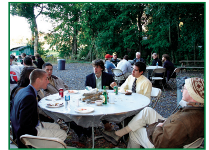
The active members hosted one of the best Homecoming Weekends in memory that was enjoyed by all who attended.

The alumni board has been active as well. We are currently waiting for bids on the Life Safety Initiative I have written about in the past. For those of you who may not already know, by 2010, our house must be fully equipped with sprinklers, hard wired fire alarm systems and other items to comply with College requirements to ensure safe living areas for all students. In addition, we have just ordered a new boiler system (at a cost of over $16,000) to replace one that has serviced the house for probably 50 years.